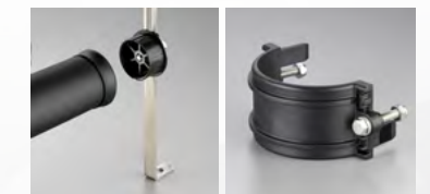
Floor bracket and end plug Half shell without Thread

For further information, please refer to our accessories catalogue.